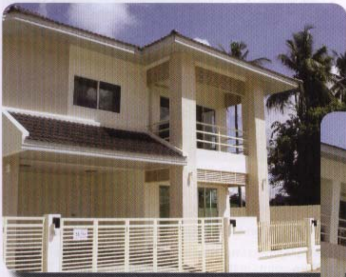
Pictured above 3 bedroom detached house

“The Meadows” – the name itself reminiscent of a haven of domestic tranquility – is the new showpiece, residential estate of the Town & Country Property Group and its “soft launch” on October 19th