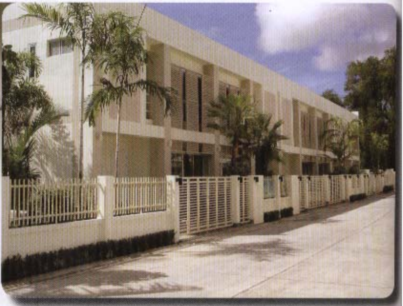
Pictured above Two Bedroom City Villas & Below 3 bed Duplex